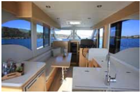
Length 10.70 m Beam 3.72 m Draft 1.30m Displacement 8.000 kg