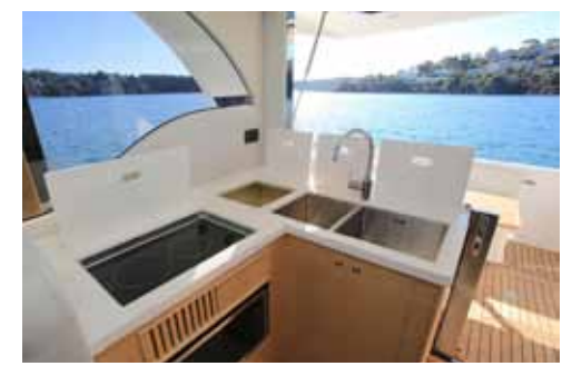
Fuel Capacity 880 Litres Water Capacity 450 Litres Holding tank 200 Litres Construction Hand laid fibreglass