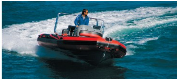
V-650 has the great stability, excellent performance - ideal dual-purpose boat