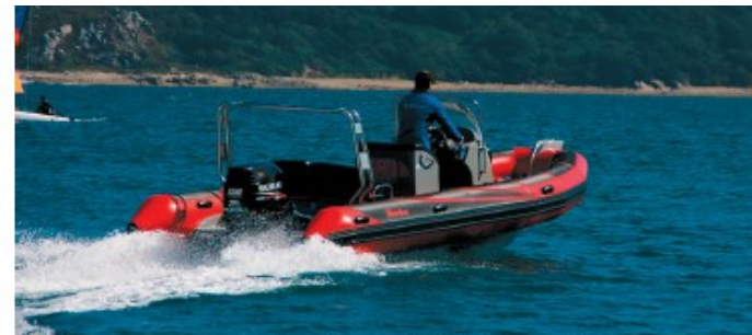
Manoeuvrable, fast and extremely stable; absolute confidence in the strength of the hull at all times