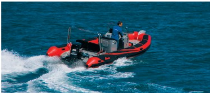
The luxury V-650 RIB tender, designed for the toughest duty and high speed driving